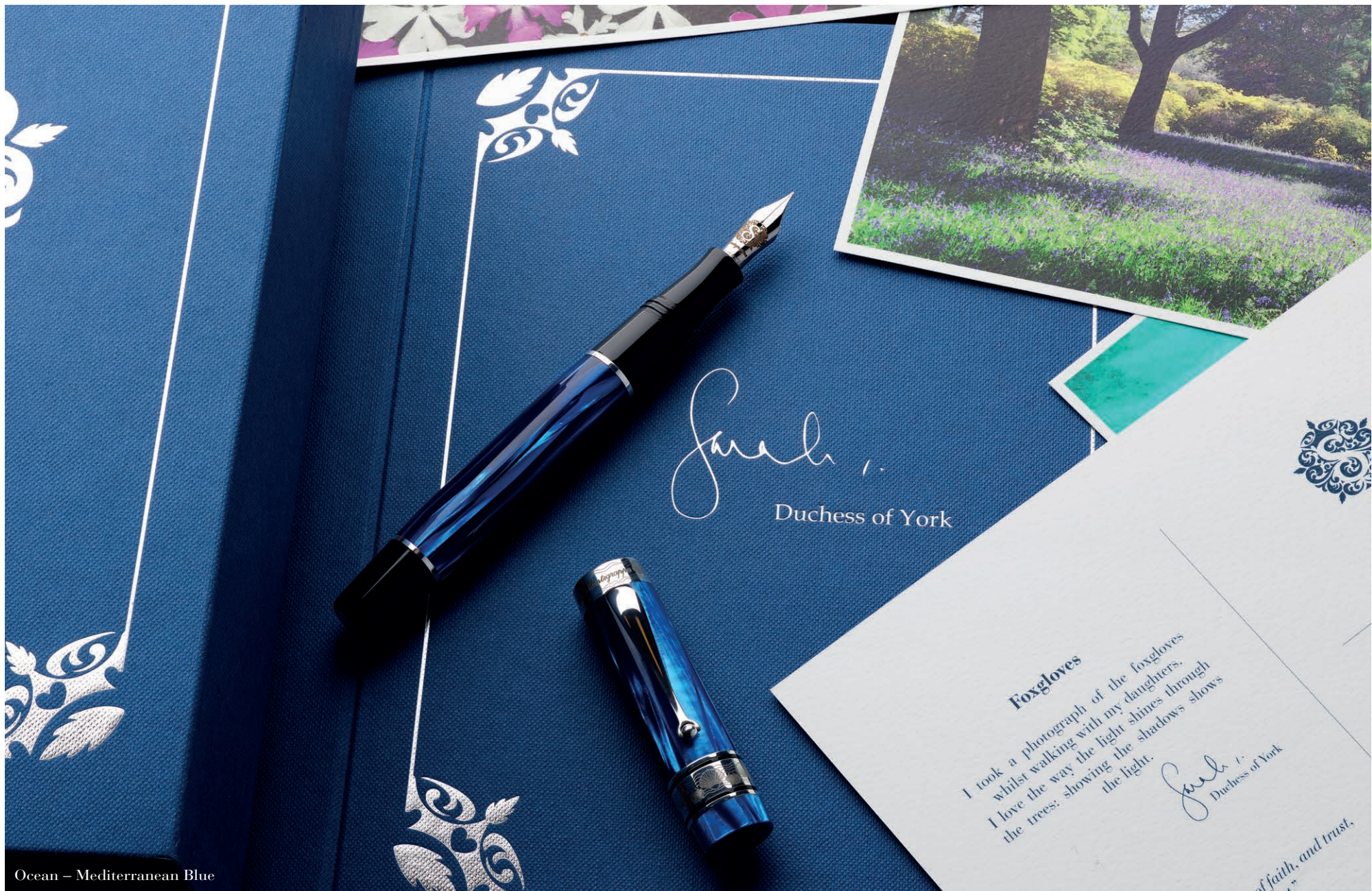
Ocean – Mediterranean Blue