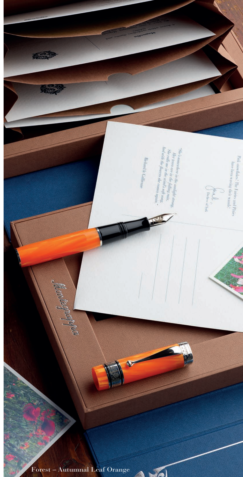
Forest – Autumnal Leaf Orange