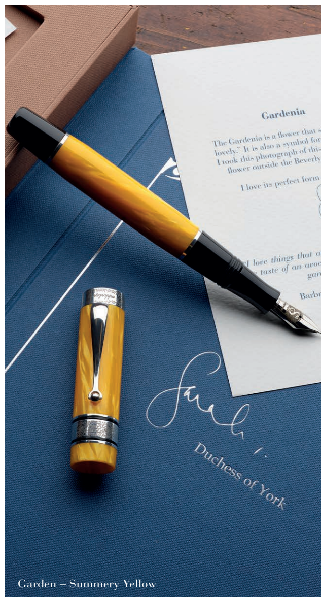
Garden – Summery Yellow

Montegrappa has a long and proud history of crafting writing instruments for members of royalty. Our archives contain numerous bespoke models made on private order or for state occasions.