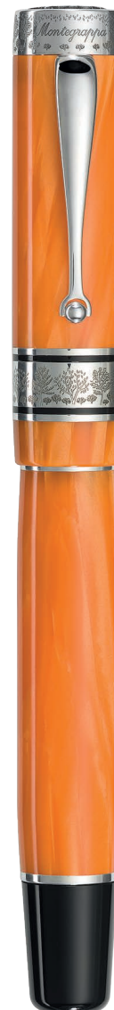
FOREST AUTUMNAL LEAF ORANGE