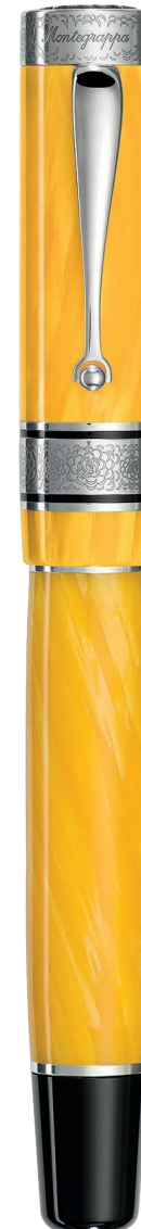
GARDEN SUMMERY YELLOW